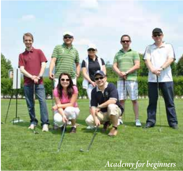
Academy for beginners