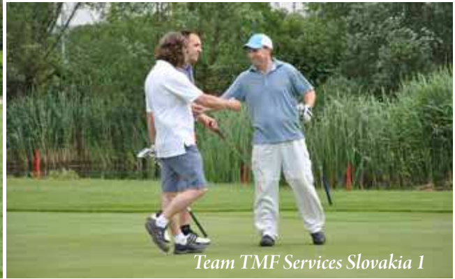
Team TMF Services Slovakia 1