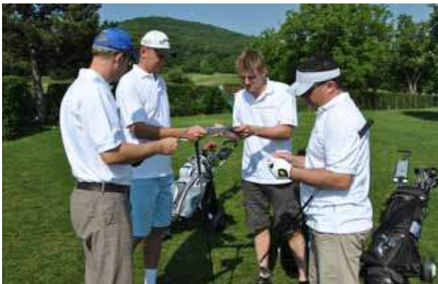
Business Lease Team